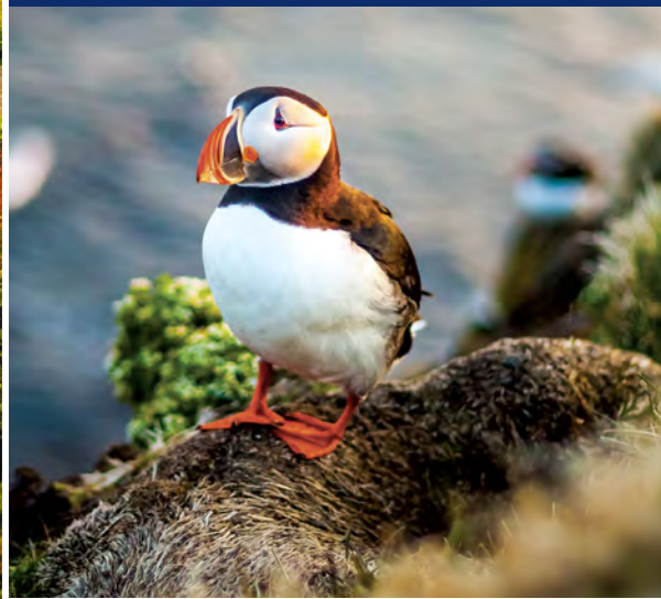
Sydney, Nova Scotia