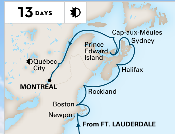
THE ATLANTIC COAST FT. LAUDERDALE TO MONTRÉAL Volendam Apr 21