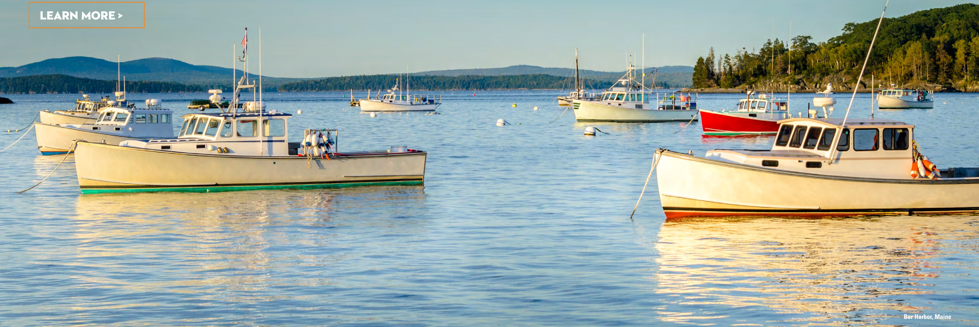
Bar Harbor, Maine