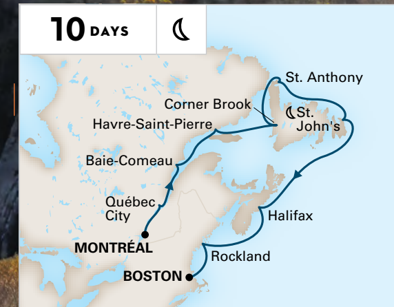
NEWFOUNDLAND & NEW ENGLAND DISCOVERY MONTRÉAL TO BOSTON Volendam Aug 31