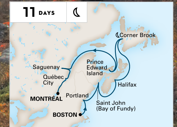
NEWFOUNDLAND & NEW ENGLAND DISCOVERY BOSTON TO MONTRÉAL Volendam Aug 20; Sep 10