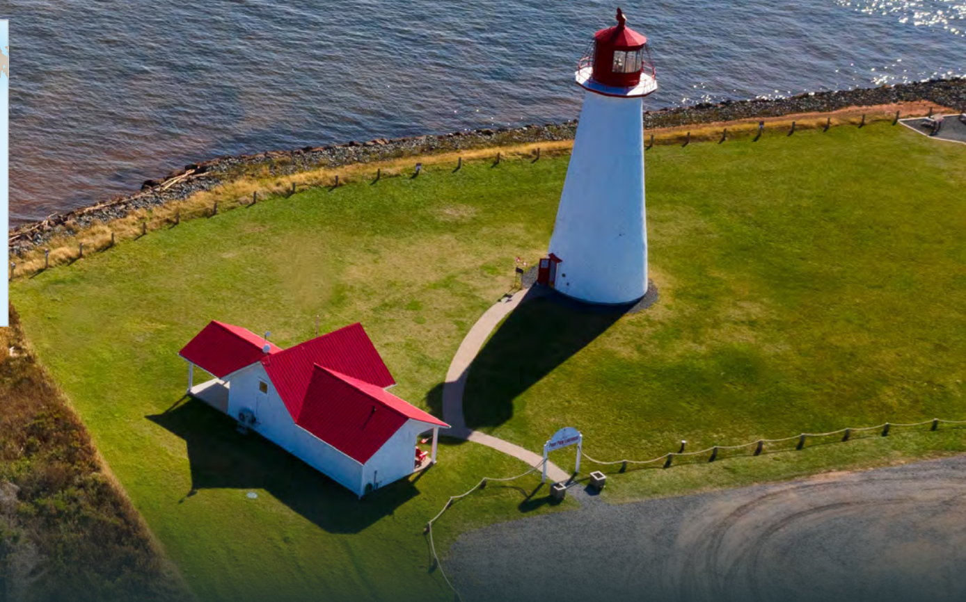
Point Prim Lighthouse, Prince Edward Island

♦ These cruises operate in reverse from Québec City to Boston; visit HollandAmerica.com for details.