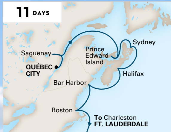
THE ATLANTIC COAST QUÉBEC CITY TO FT. LAUDERDALE Zuiderdam Oct 12

Our flexible itineraries either depart from or arrive in Fort Lauderdale, allowing you to combine your Canada & New England vacation with a cruise along the beautiful Atlantic Coast. Drive along Cape Breton's scenic Cabot Trail and visit some of New England's most iconic cities, including Bar Harbor and Boston. Relax while taking in coastal views from your private verandah and keeping watch for whales and dolphins in the waters below. However you choose to cruise, these Atlantic Coast sailings are sure to offer just what you're looking for.