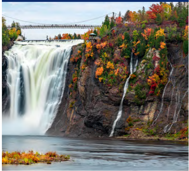
Québec City, Québec