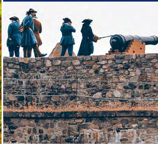
Cape Breton, Nova Scotia