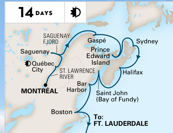
THE ATLANTIC COAST MONTRÉAL TO FT. LAUDERDALE Volendam Oct 5